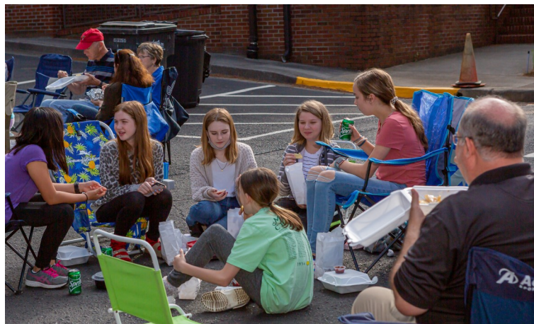
Food Truck Friday, April 23, 2021