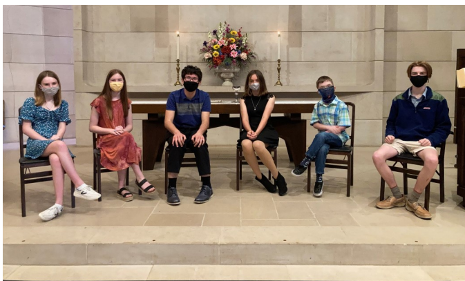
Youth Sunday, April 18, 2021